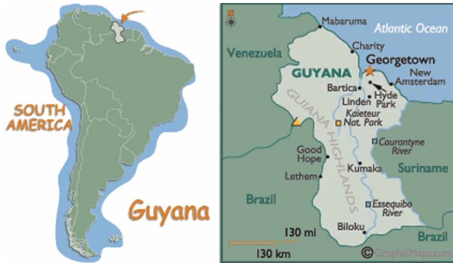
FIGURE 1. Map of Guyana.

defunct by the late 1930s and the Sad'r Anjuman-E-Islam filled the void. Present day Guyana is home to a large number of Islamic organizations. Some that are well known include: Guyana United Sad'r Islamic Anjuman (GUSIA); Anjuman Hifazatul Islam (Hifaz); Central Islamic Organization of Guyana (CIOG); Guyana Islamic Trust (GIT); Muslim Youth League (MYL); and Hujjatul Ulama/Tablighi Jama'at.